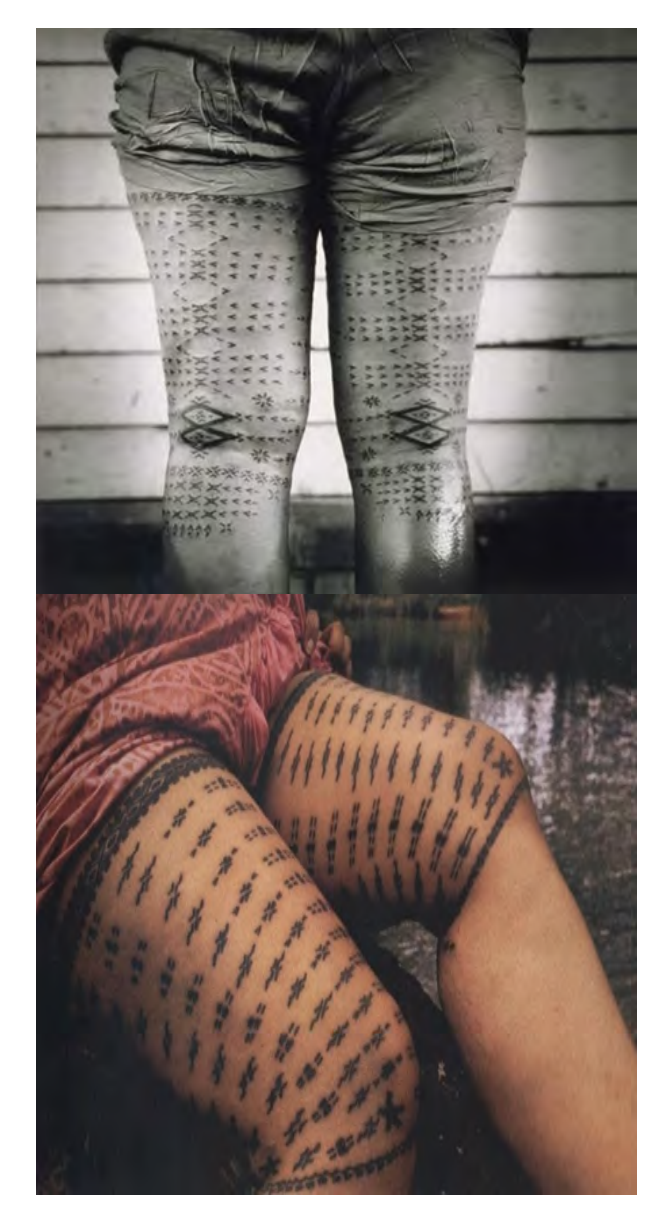
Samoan woman with the malu