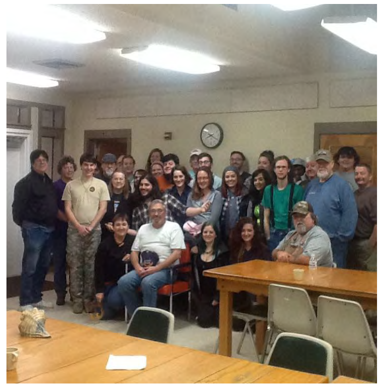
UPPA "Friends of Poverty Point" Group Photo Spring Equinox 2015