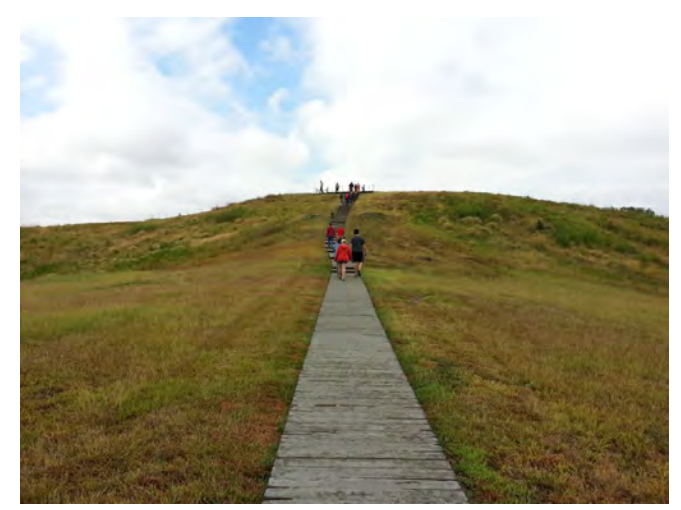
Anthropology students climbing the Bird Mound