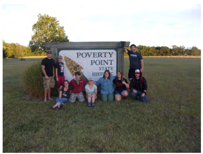
1<sup>st</sup> UPPA "Friends of Poverty Point" UL Anthropology group photo before World Heritage Status; Fall 2013 – The birth of a tradition!