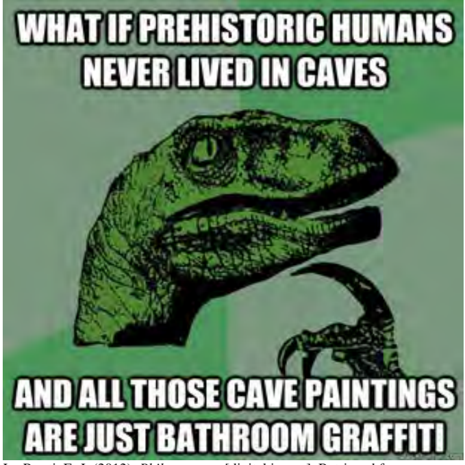
Lo Presti, E. J. (2012). Philosoraptor [digital image]. Retrieved from https://elizlopresti.wordpress.com/tag/memes/