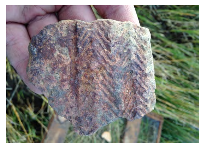
Marksville culture pottery found while surface collecting