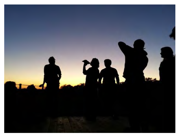
The blowing of the conch atop Bird Mound to call the spirits during the Spring Equinox Celebration

The work that occupies our time on Saturday is often overshadowed by the rest of the weekend's activities. On every trip, we climb to the top of the largest earthen mound in the southern United States, the Bird Mound, to see the sun set over the horizon before the stars come out. Another mound routinely visited is Sarah's Mound, the only burial on the property. We pay our respects and learn about a different era of Poverty Point. An atlatl competition is held when weather permits, where we are able to use an ancient tool resembling a lacrosse stick to throw darts. At night, when we are not on the mound, we stay up late playing card games with the friends we have made there. Whether we are exploring the World Heritage Site, visiting the museum to become Jr. Rangers, relaxing around a campfire, or eating one of the great meals we always have, the trip with the Friends of Poverty Point group is an experience I'd recommend to anyone with an interest in culture, history, art, or adventure. Join the Friends of Poverty Point Facebook group to keep in touch!